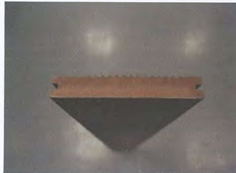
Fig 2. Section view