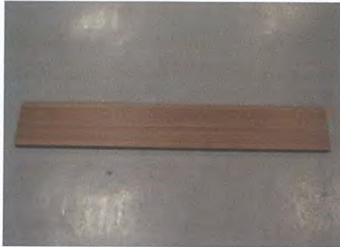
Fig 1. Front view